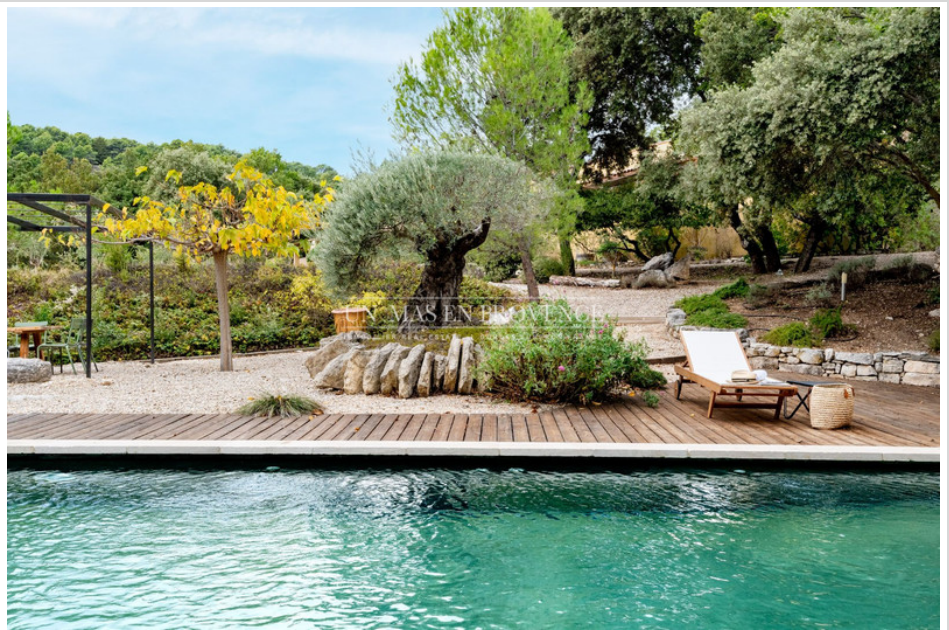
Villa Ref. : L2039M Murs

Document non contractuel 12/05/2024 - Prix T.T.C